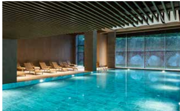
WOMEN'S ONLY INDOOR POOL