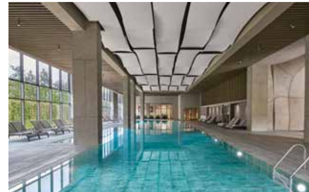
FAMILY INDOOR POOL