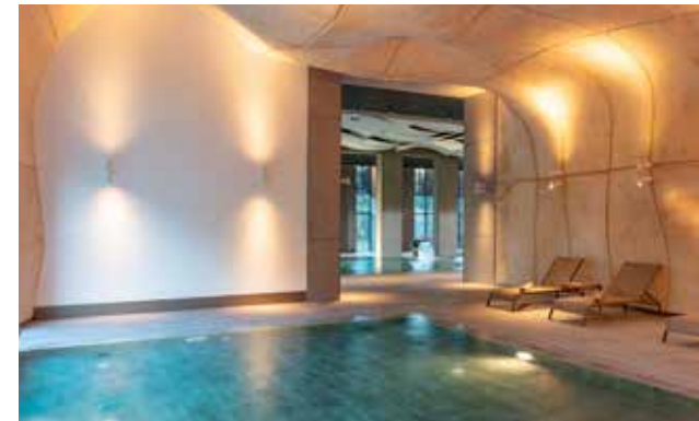
CHILDREN'S INDOOR POOL