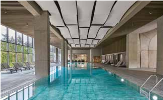
FAMILY INDOOR POOL